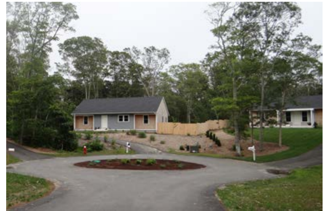
Bevan Way, Orleans