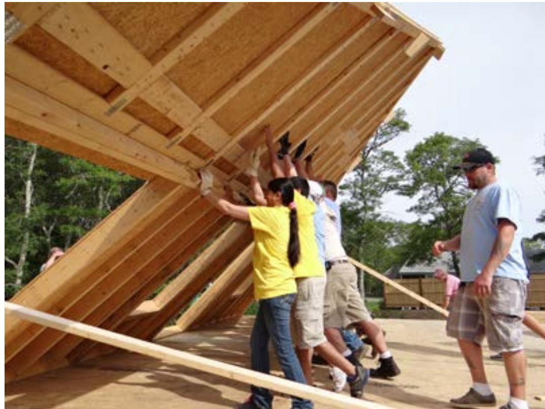
Volunteers raise a wall on Oak Street in Harwich