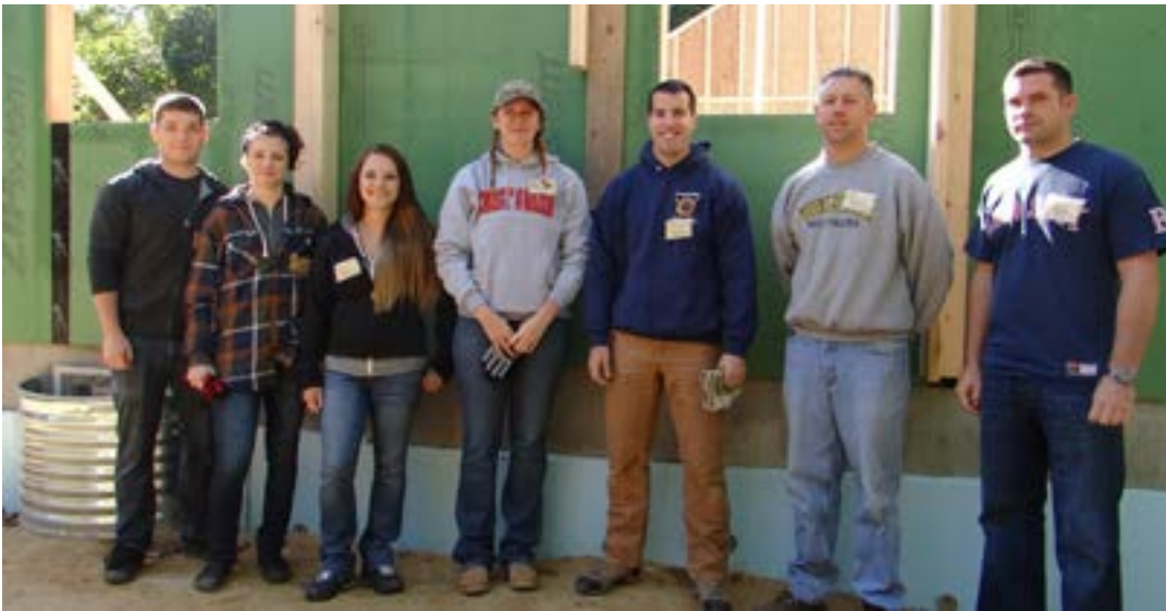
We can always count on the Coast Guard.