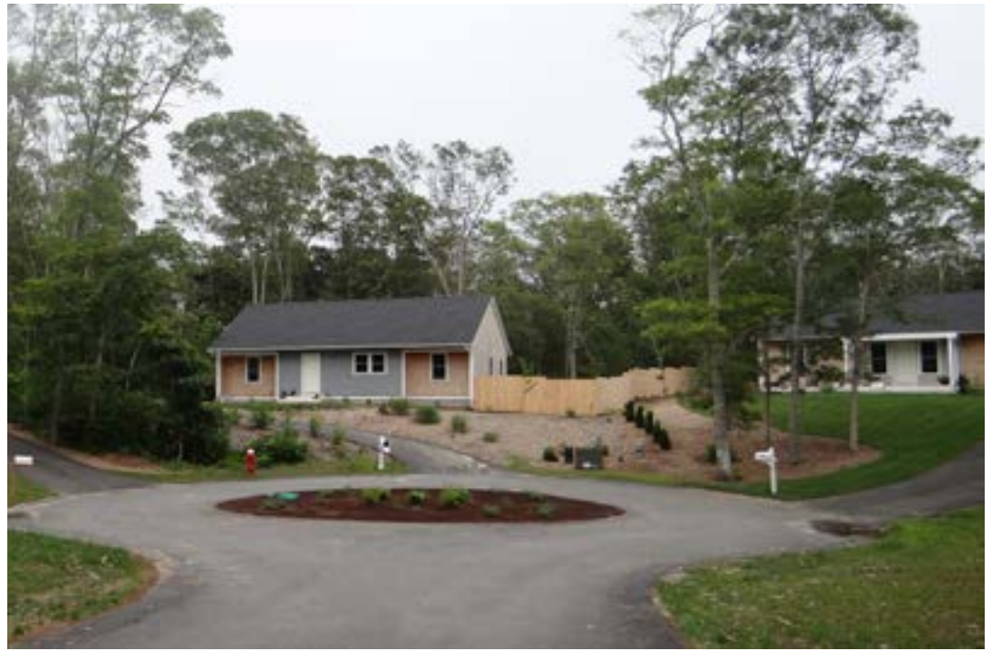
Bevan Way, Orleans