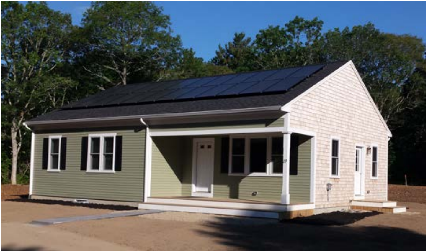
A solar home, soaking up the sun.