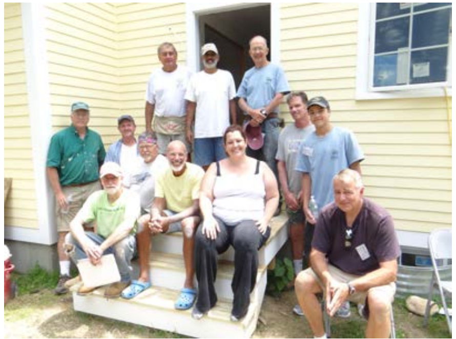
Glenwood Avenue, Falmouth