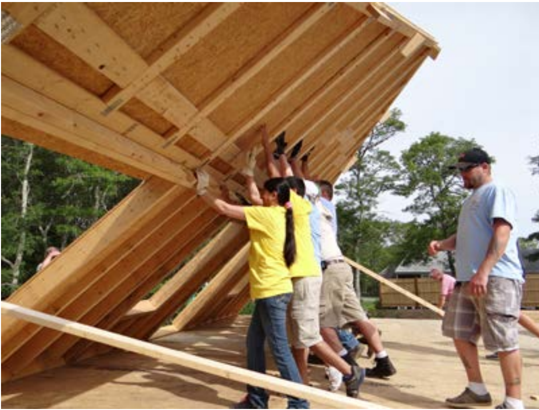
Volunteers raise a wall on Oak Street in Harwich