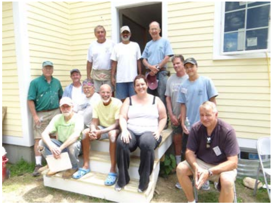
Glenwood Avenue, Falmouth