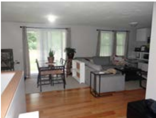
The view inside a Habitat home.