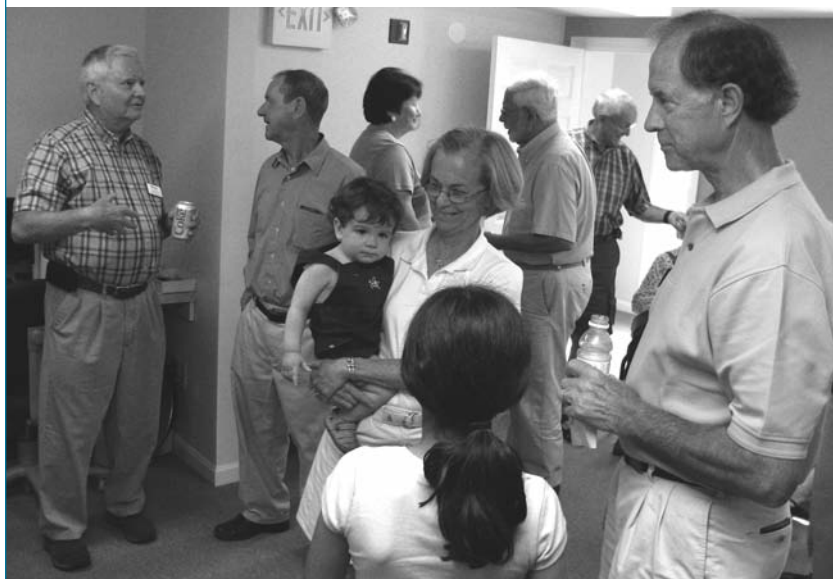
Volunteers and families gathered to celebrate the official opening of our new office in Yarmouthport.