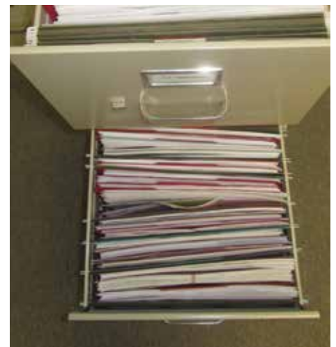
Application files - organized and ready

to the very last step: the lottery. The lottery is not public, but it is witnessed by an outside agency, usually a representative from the Town's Affordable Housing Committee. The lottery is set up to give preference to families that will "fill the house." Towns are also allowed to designate that 70% of houses built give resident preference. The most joyful part of the entire process comes at the very, very end: we send a small group—on some pretense—to the applicant's home to see them again. Only when they open the door to smiling faces bearing a gift, do they realize that they have been chosen to partner with us and are about to embark on an amazing homeownership journey.