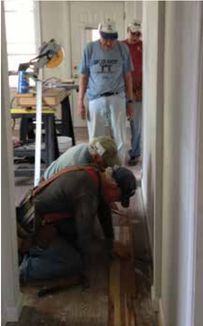
Disaster Relief Team