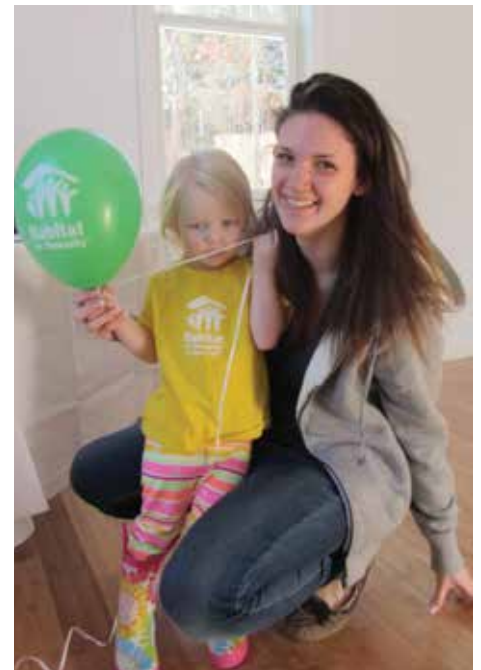
Enjoying a Home Dedication

Habitat for Humanity of Cape Cod is indeed rich with talented volunteers. But we feel especially wealthy with devoted, generous, and highly skilled volunteers such as those who serve on the Family Selection Office Team. Volunteers at this high level actually function as volunteer staff, and nothing would get done around here without them!