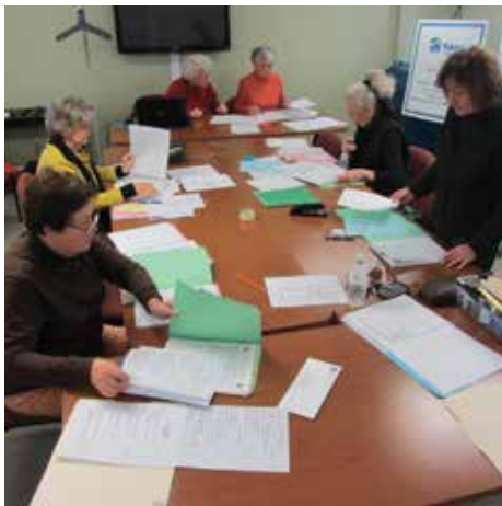
Family Selection Office team in action

The home application process is somewhat invisible to those outside the Habitat office, in part because of its confidential nature. The Office Team—the first stop in that process—is small, with only about six members. Even this year, with well over 100 applications processed, they accomplished their task, largely due to the highly efficient systems they have developed over the