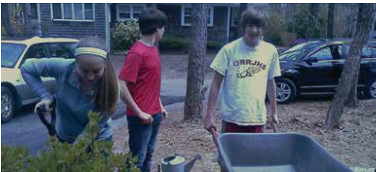
Falmouth Jewish Congregation Mitzvah Day