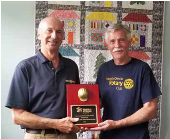
Community Partner Award Rotary Club of Harwich - Dennis