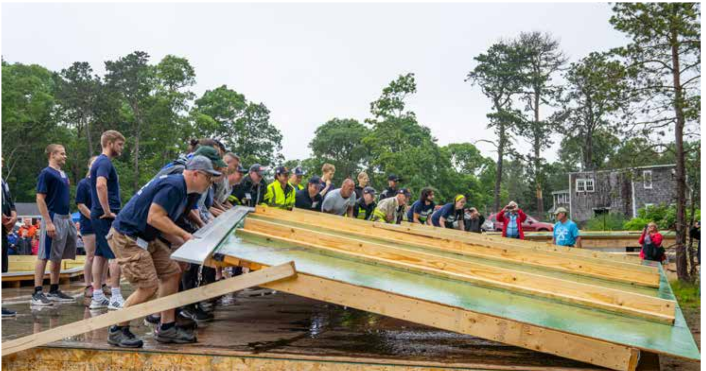
Harwich Police and Fire Departments helping the home buyers lift their heavy walls on Murray Lane on Wall Raising Day