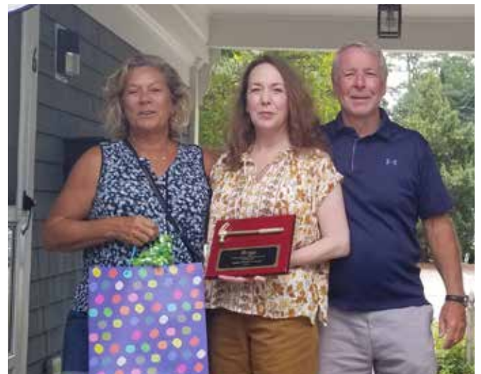
Golden Hammer Award Boston Granite Exchange