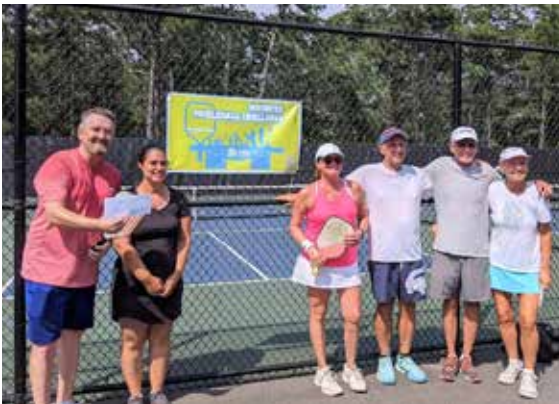
Mashpee Rec Pickleball Challenge