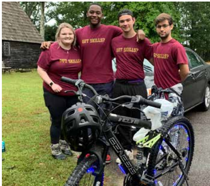
Skills USA students at Ride for Homes

We are so grateful to everyone who participates in these events!