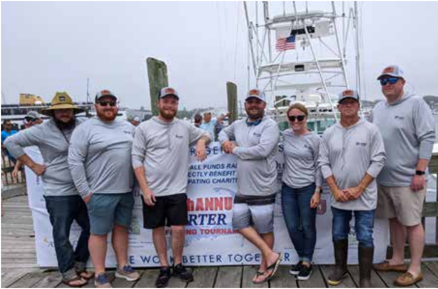
Charter Cup Fishing Tournament