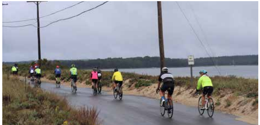
Ride for Homes