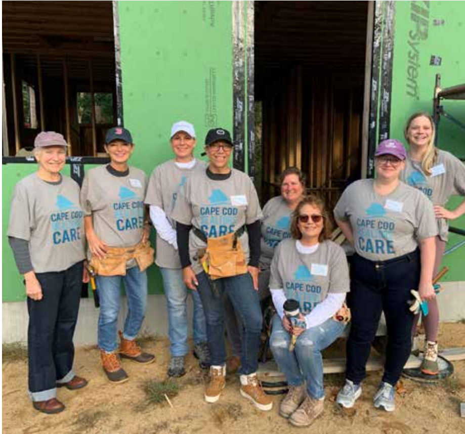
Cape Cod & Islands Association of REALTORS (CCIAOR) Team Day on the Murray Lane, Harwich build site.