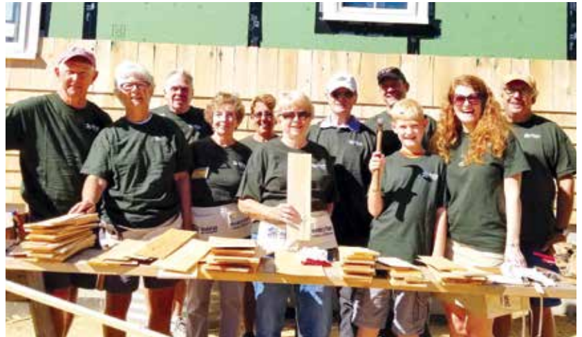
Cotuit Federated Church