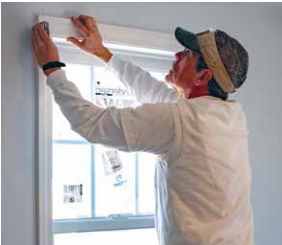
Windows being touched up