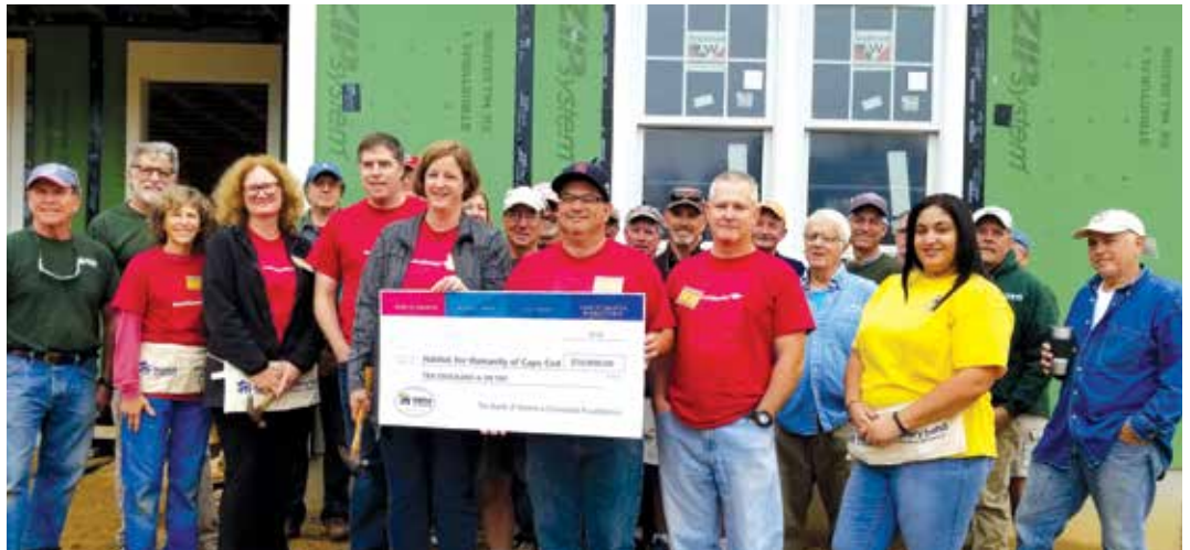
Bank of America