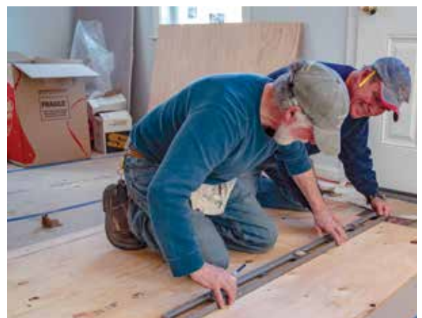
Laying bamboo flooring