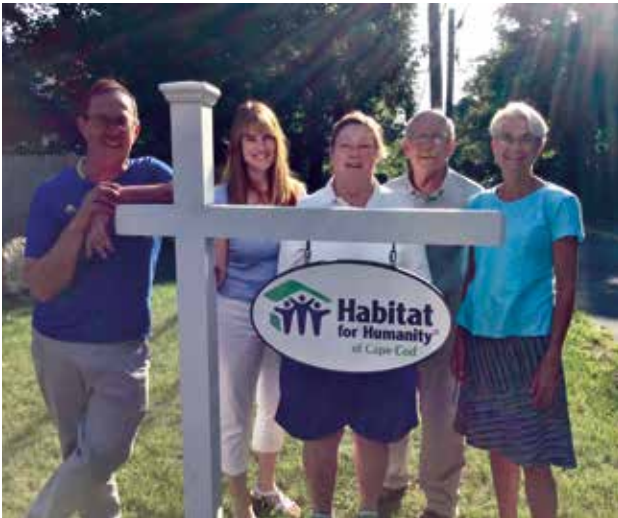
Town of Brewster, Community Partner Award