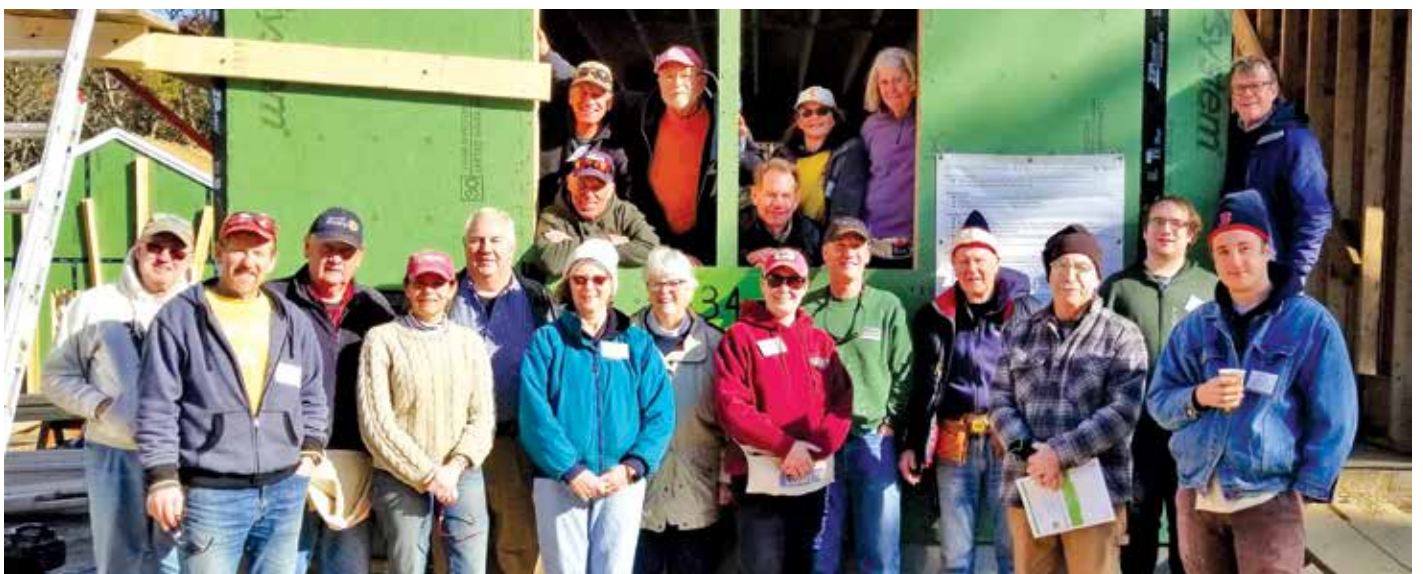
Nauset and Chatham Rotary Clubs