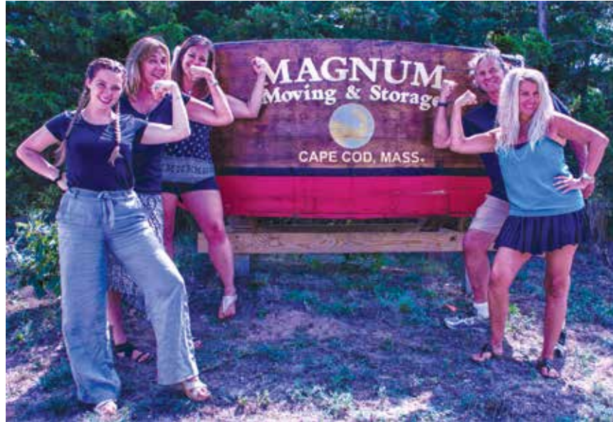
Magnum Moving, Golden Hammer Business Award