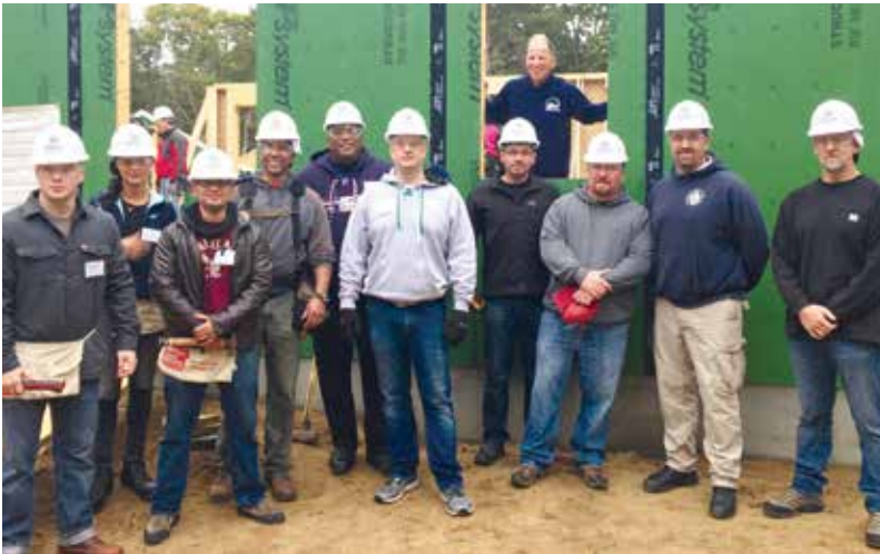
Dennis and Barnstable Police and the Coast Guard lending a hand on Wall Raising Day, Janall Drive