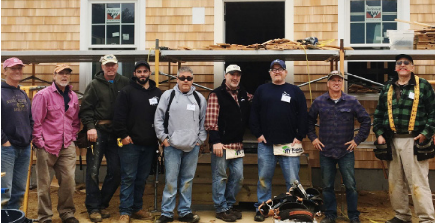
Cape Air on Durkee Lane, Wellfleet