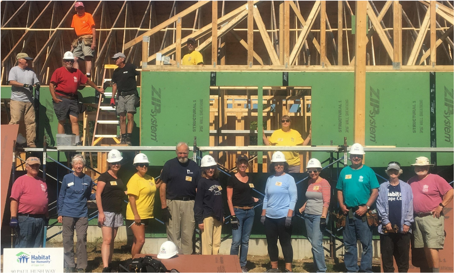
Team Infor on Paul Hush Way, Brewster