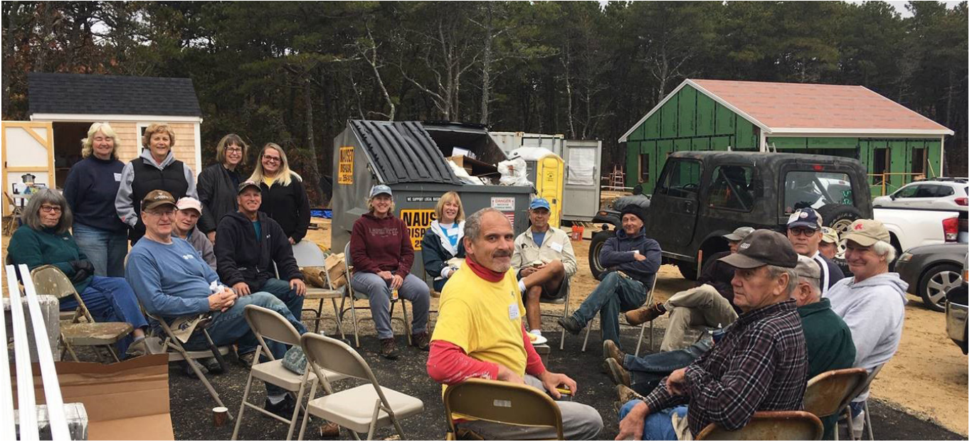
The Crew takes a break on Durkee Lane, Wellfleet