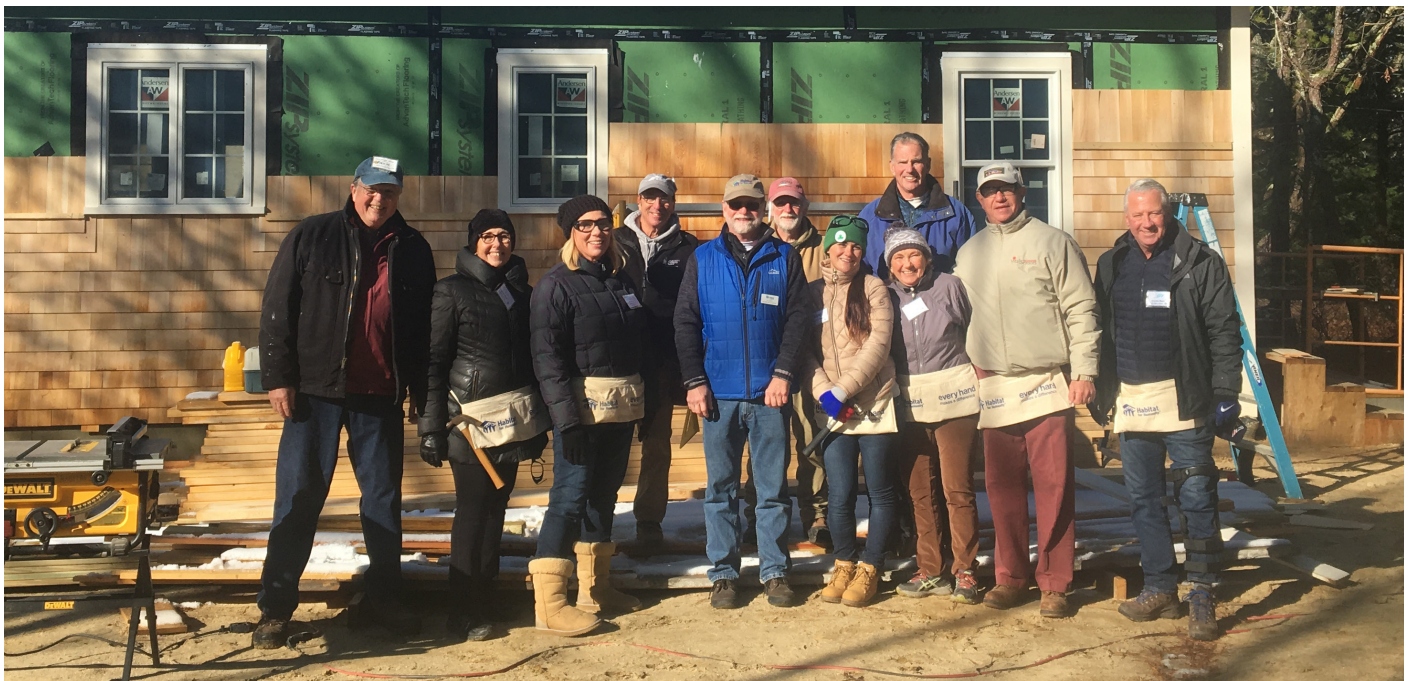
Willowbend Team Day on Degross Road, Mashpee