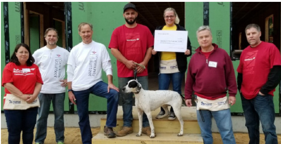
Bank of America Team Day on Durkee Lane, Wellfleet