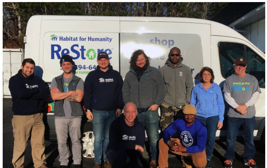
Yarmouth ReStore Staff