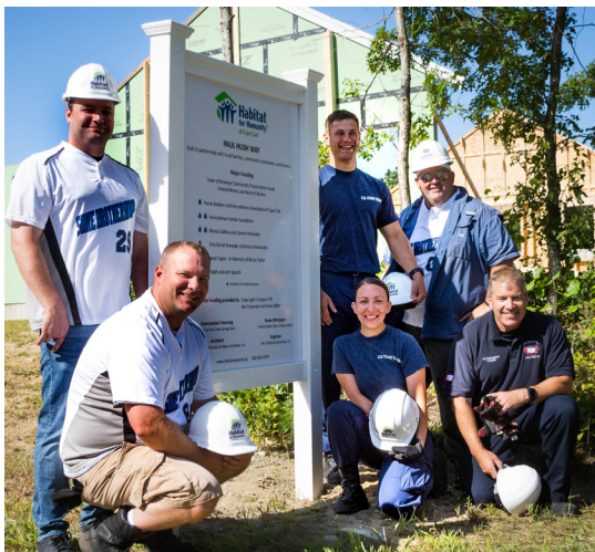
Brewster Police and Fire helping out on Wall Raising Day, Paul Hush Way, Brewster