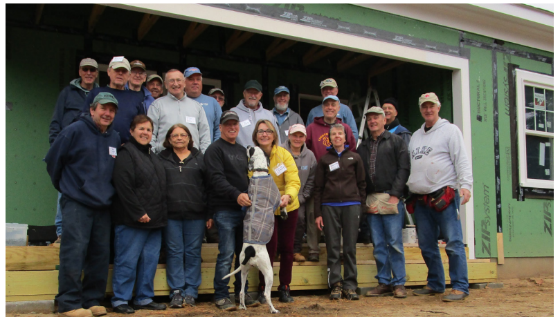
St. Joan of Arc Team Day on Durkee Lane, Wellfleet