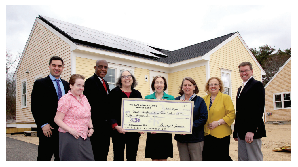
Cape Cod Five Awarding Employee Chosen Grant