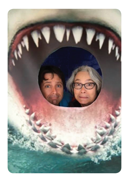
Fun at the Falmouth ReStore