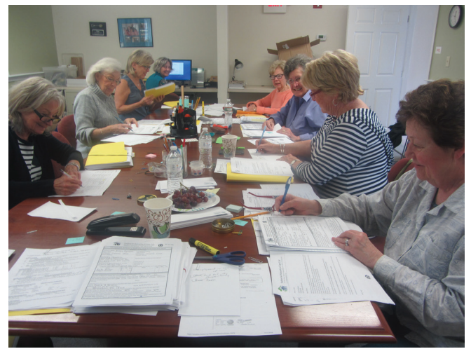
Office Team sorting applications for Dennis homes