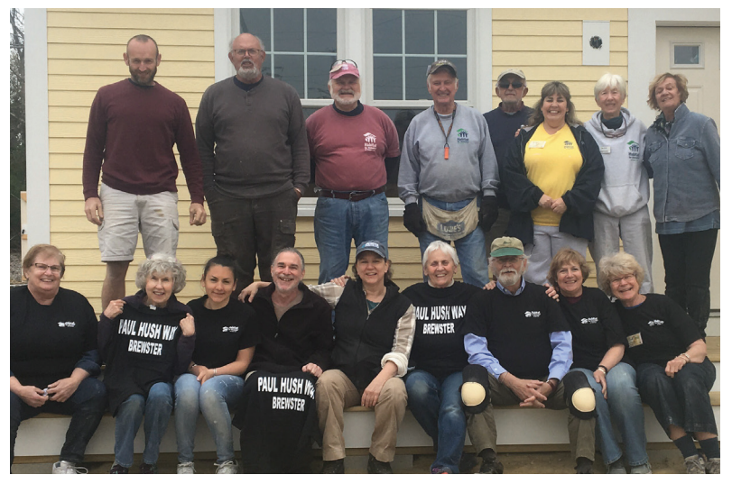
First Parish Brewster Team Day