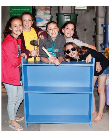
Harwich Girl Scout Bookcase Project