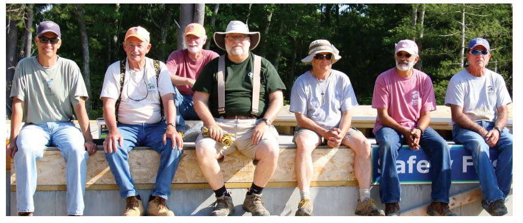
The Prep Team from Marstons Mills takes a break on Wall Raising Day