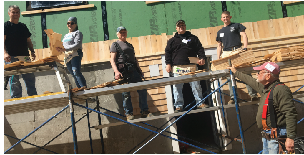
Truro Police Department Team Day