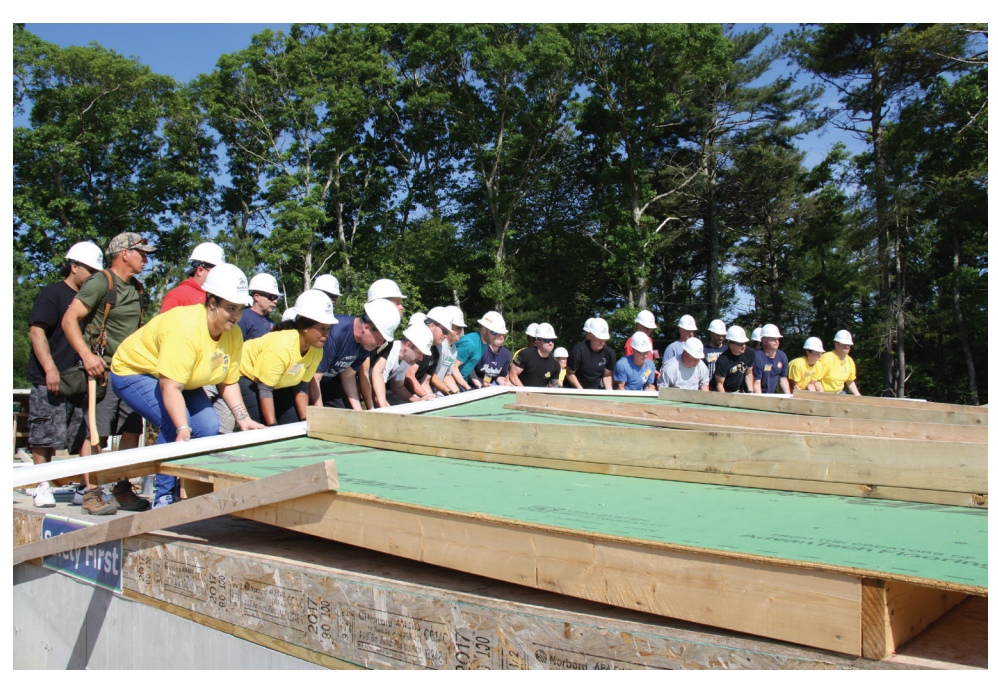
Thank you to everyone who made this special day so spectacular and thank you to the Town of Barnstable Community Preservation Funds, Barnstable Affordable Housing Trust, Community Development Block Grant, Federal Home Loan Bank of Boston, Housing Ministries of New England, Eastern Bank and Cape and Islands United Way.

Even if your name is not on a road sign, everyone reading this newsletter is an important part of Habitat Cape Cod. Your donation, action or kind words have made a difference and that has changed the course of lives and many lives to follow. Thank you for being a part of making this little corner of the world a better place.