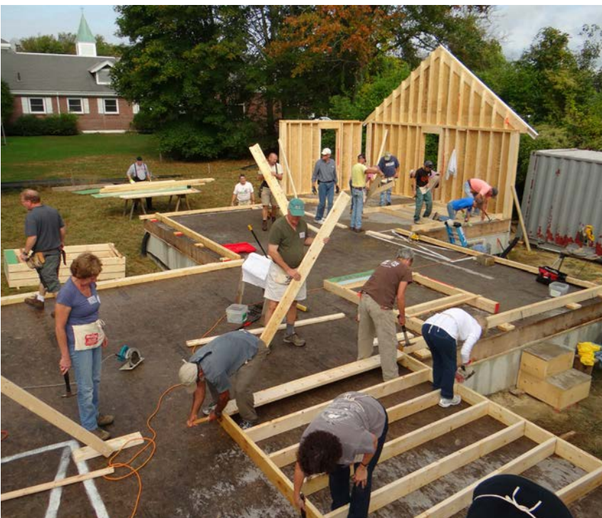
Wall Raising Day on Glenwood Ave

It's been a few years since we last had the opportunity to build in Falmouth but we are back!