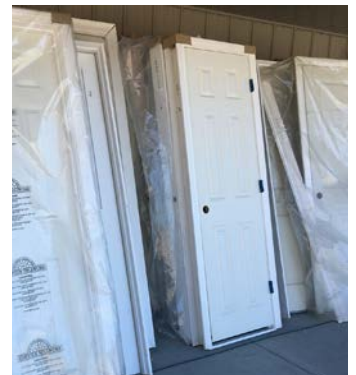
Just some of the great items at our stores last month!

805 Gifford St. Ext. Falmouth • 28 Whites Path So. Yarmouth • Monday through Saturday 9-5 • Visit restorecapecod.org and click on Donate to schedule a pickup or call (508) 394-6400 to learn more!