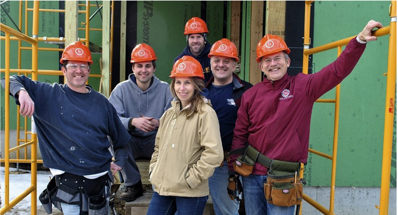
Hutker Team Day in Falmouth on Glenwood Ave in 2013