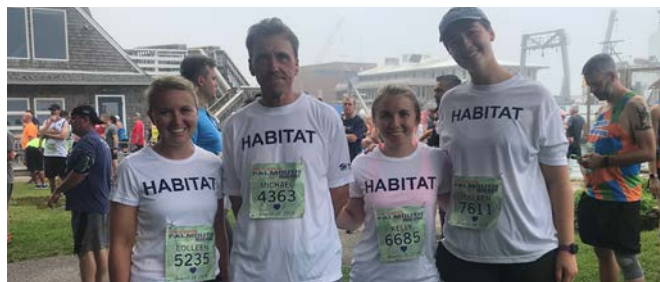
Members of Team Habitat getting ready to run the Falmouth Road Race

You could win this 8'x10' Cape Quivett Shed donated by Pine Harbor