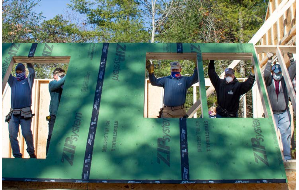
Quanset Road, Orleans Wall Raising