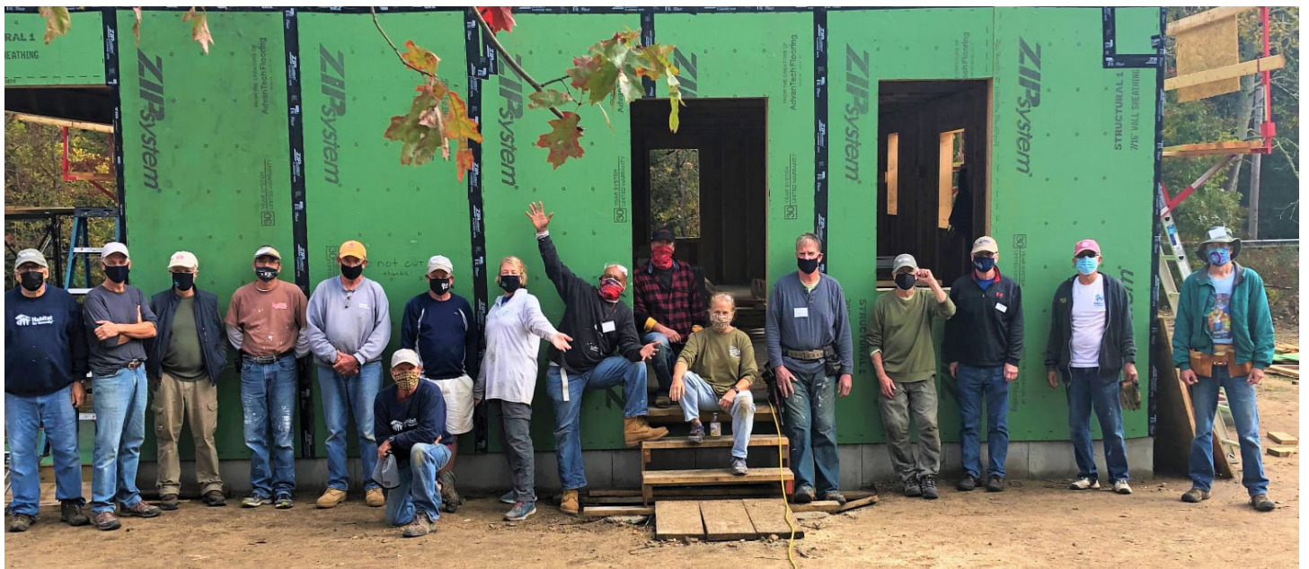
Mendes Way, Mashpee