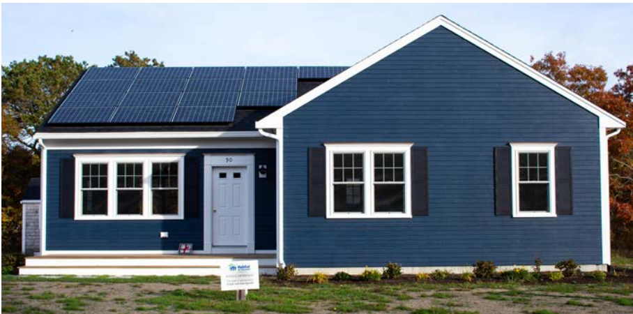
Meghan and Mark's home