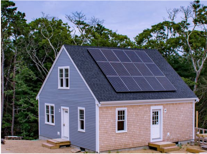
Equipping a home with solar costs about $20,000

homes offering the best air quality possible. Air source heat pumps (which heat and cool our homes) make a significant contribution to that end goal.