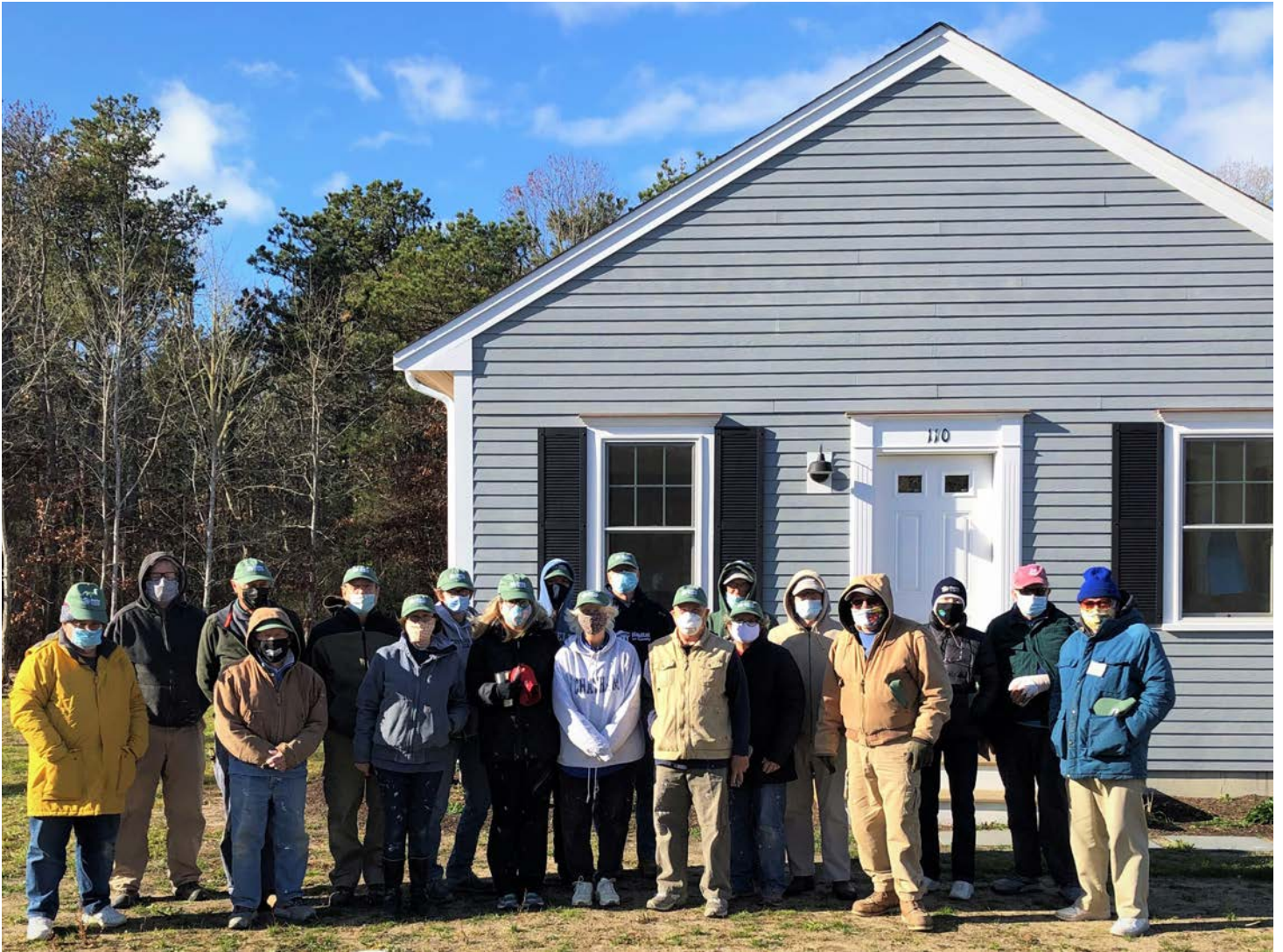
Last day of construction for volunteers on Paul Hush Way, Brewster