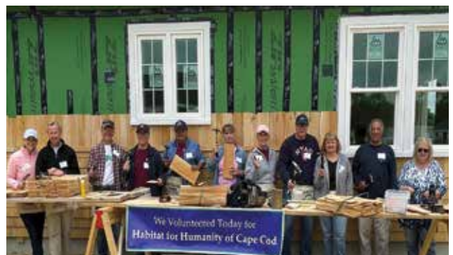
Waquoit Church Team Day in Falmouth