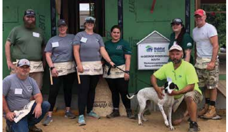
Shepley Team Day in Chatham