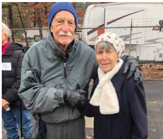
Wall Raising Day on Cotuit Road, Sandwich

Families are permanently removed from the cycle of housing crisis.