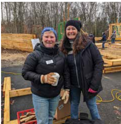
Wall Raising Day on Cotuit Road, Sandwich