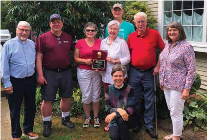
Community Partner Award St. Mary's Episcopal Church - Barnstable