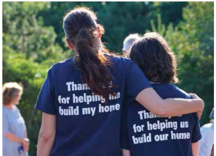
Homebuyer and her child in Falmouth on a Home Blessing Day