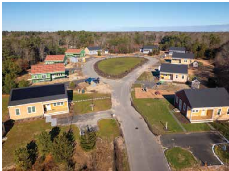
10 home build in Falmouth