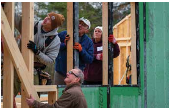
Wall Raising Day on Nauset Street, Sandwich