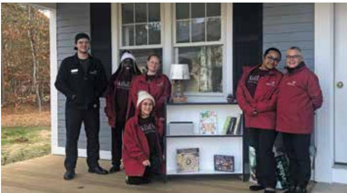
Harwich Tech Students built bookcases for Harwich Dedication