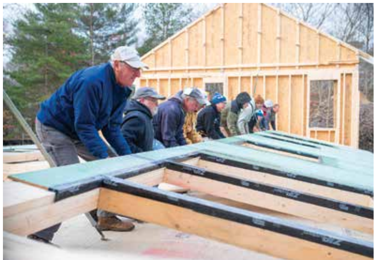
Wall Raising Day on Nauset Street, Sandwich