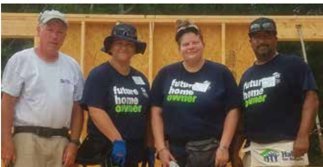
Volunteers and Homebuyers in Harwich