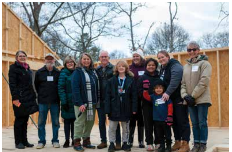
Wall Raising Day on Nauset Street, Sandwich