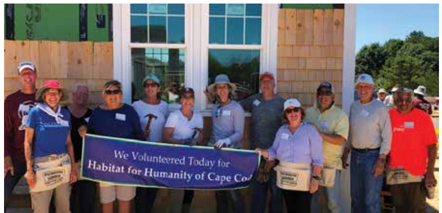
Willowbend Team Day in Falmouth