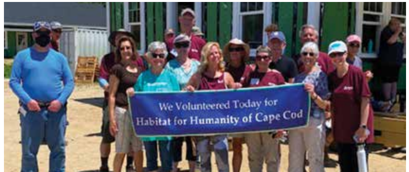
St. Mary's Team Day in Falmouth