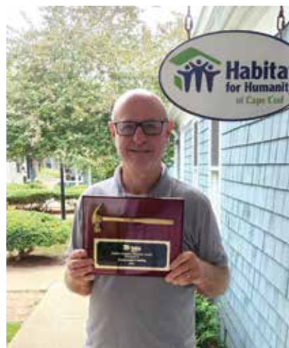
The Golden Hammer Business Award Sunderland Printing