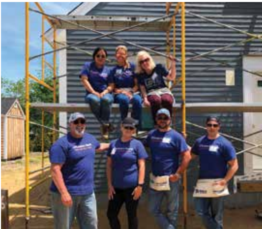
Eastern Bank Team Day in Harwich