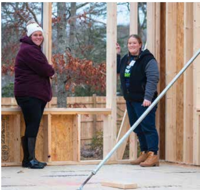
Wall Raising Day on Nauset Street, Sandwich