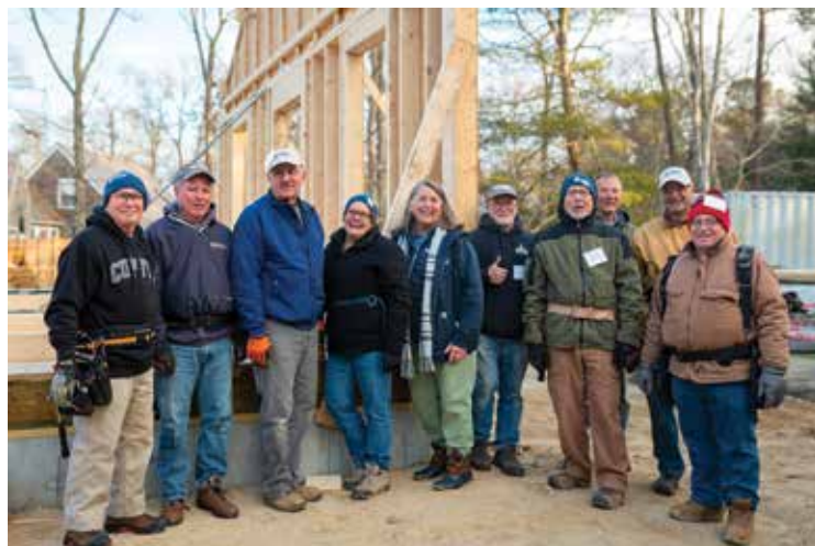
Wall Raising Day on Nauset Street, Sandwich