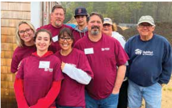
Clickstein Family Team Day in Falmouth